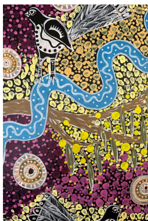
One of 2023's artworks by Bianca Willder

Enable WA acknowledges the traditional custodians throughout Western Australia and their continuing connection to the land, waters and community. We pay our respects to all members of the Aboriginal communities and their cultures; and to Elders both past and present.