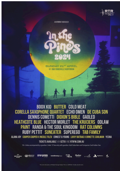
A poster for In the Pines 2024.